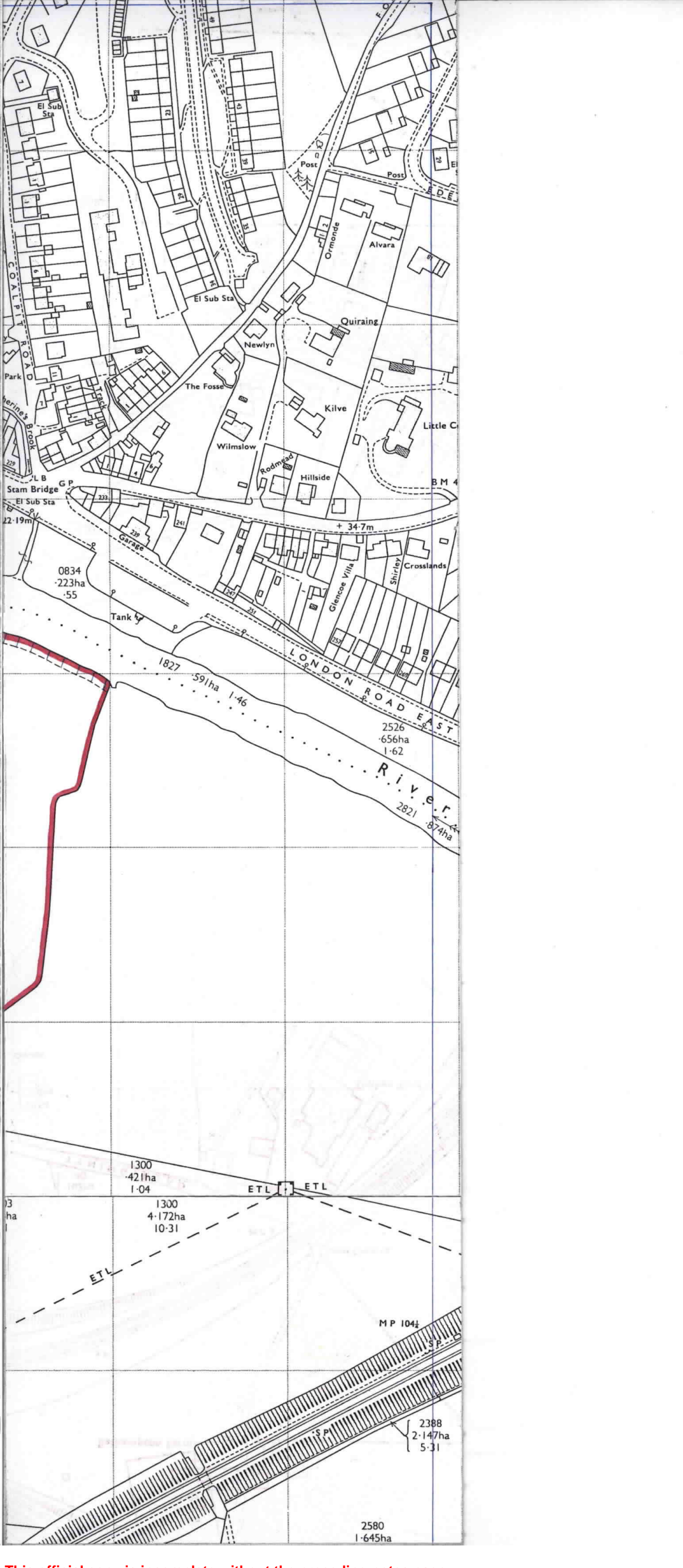
This official copy is incomplete without the preceding notes pag